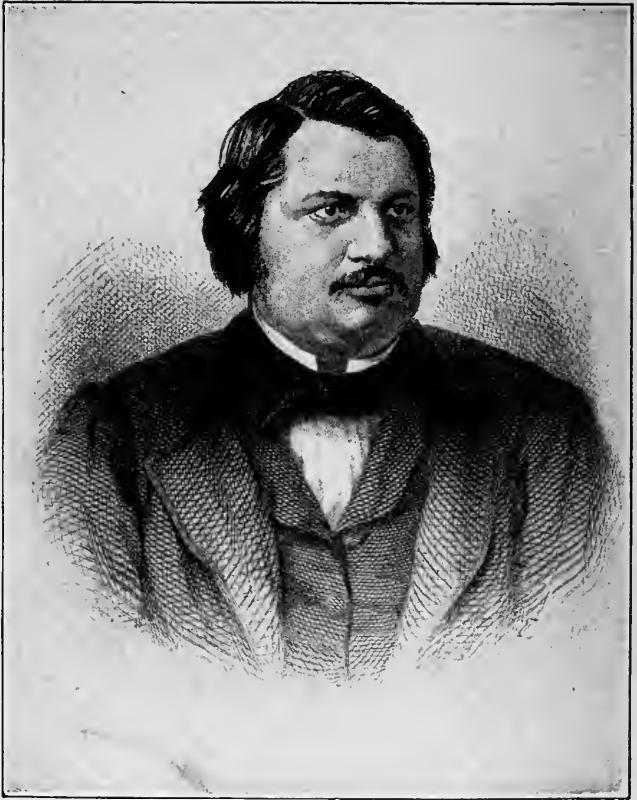
Honoré de Balzac